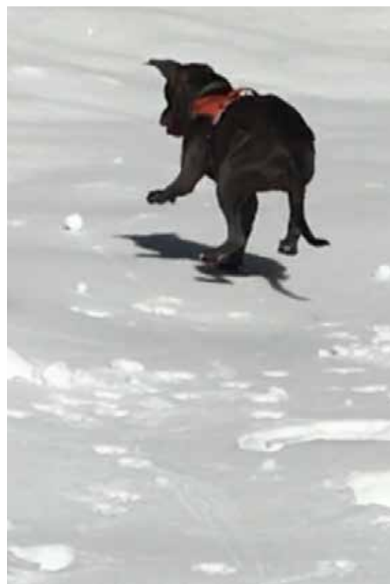
Hooch chasing snow balls