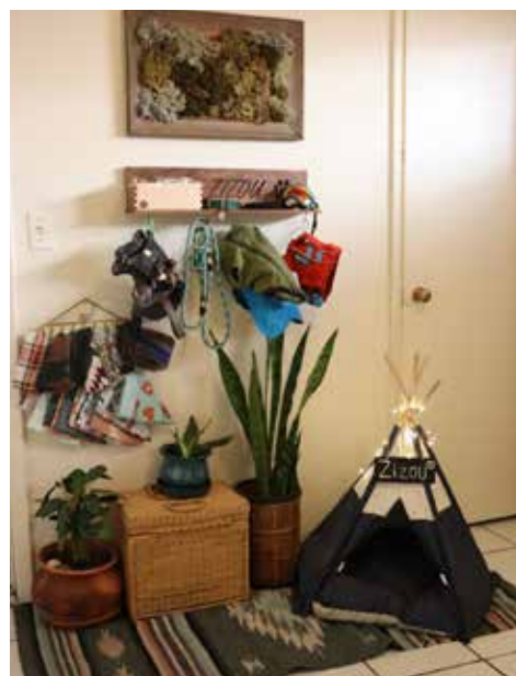
Zizou bedroom teepee & gear