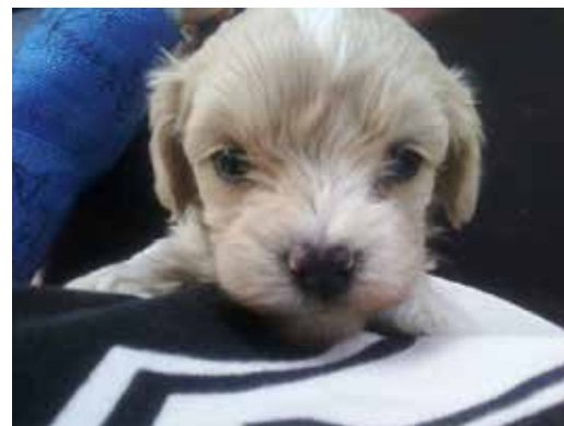
Ollie As a tiny puppy

While this was his first photo contest, he came in 2nd recently at an event that would have led to a TV commercial for a national pet food chain! He'll be notified in the spring regarding another chance at an audition, so perhaps we'll see him on our screens soon.