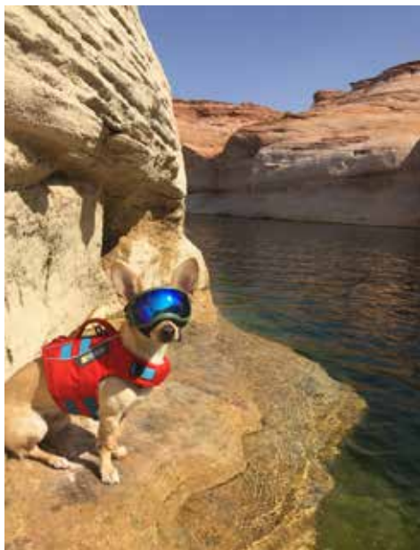
Zizou getting ready to kayak