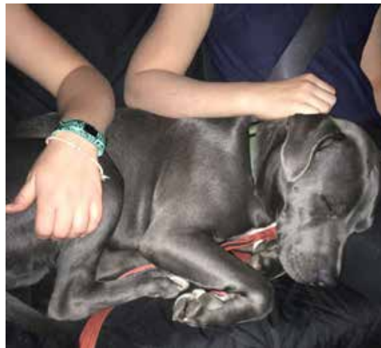
Hooch tired out after his cover dog photo shoot